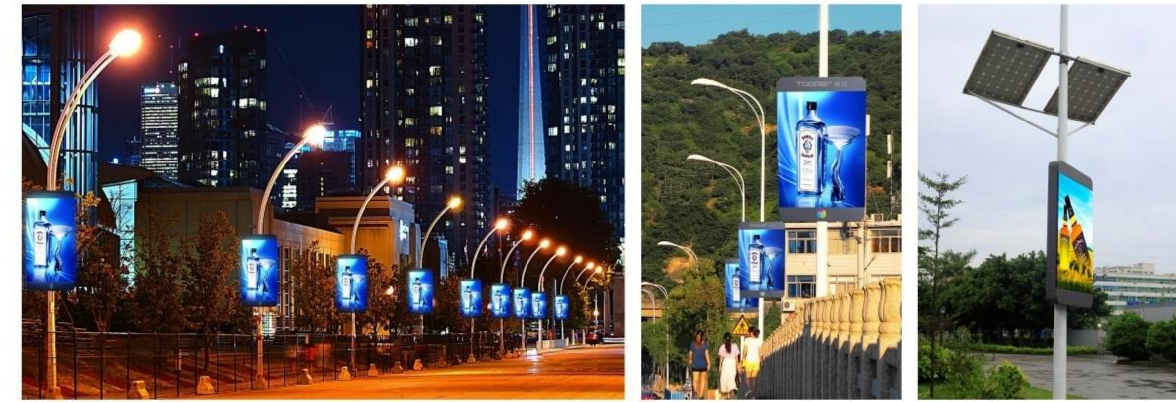
参数 Panel Specification